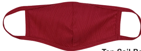
Top Sail Red